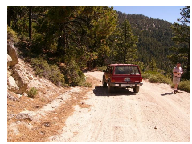
King's Canyon Road