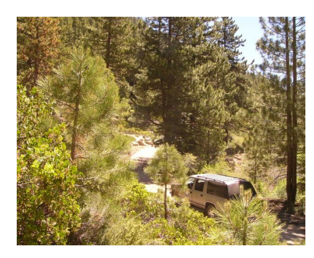
Approaching Swift's, 2005