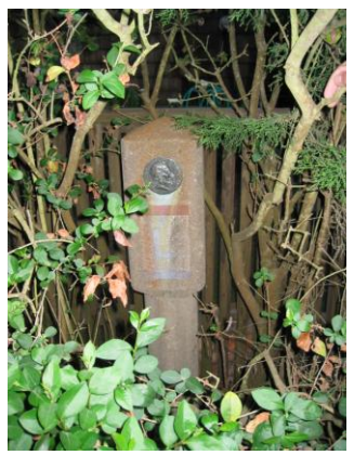
Last Extant Marker 32<sup>nd</sup> Ave. San Francisco