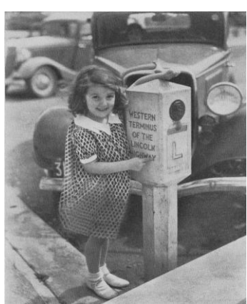
1928 Western Terminus Marker Palace of the Legion of Honor