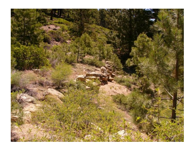
Swift's Hotel Foundation