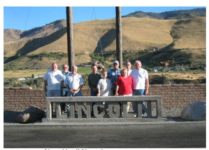
Near Verdi Nevada