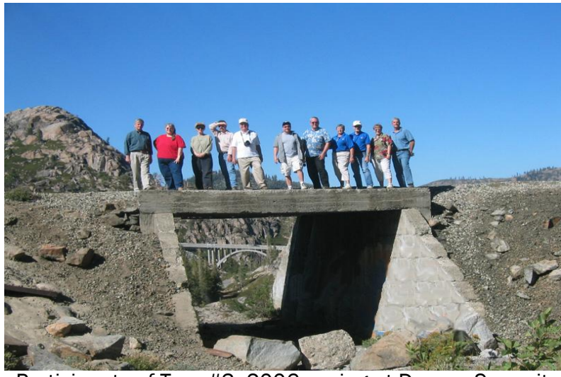
Participants of Tour #3, 2006 posing at Donner Summit

NOTE: All tours depart the Holiday Inn Sacramento Northeast, Madison @ I 80 at 9:00 am. Boarding begins at 8:45 am.