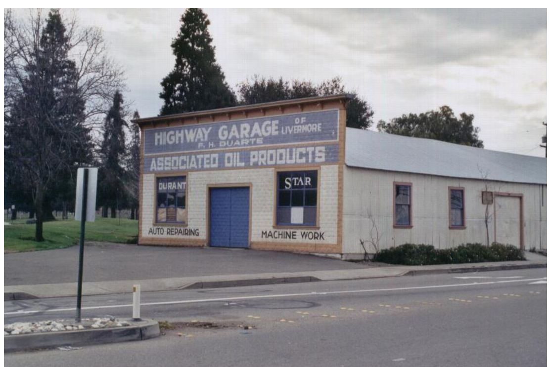
The Duarte Garage on Portola Avenue Livermore, California

This Historic building is maintained by the Livermore Heritage Guild and serves as a Lincoln Highway Museum.