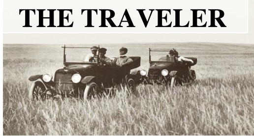
34735 Bernard Drive Tracy, CA. 95377

LINCOLN HIGHWAY ASSOCIATION CALIFORNIA CHAPTER NEWSLETTER