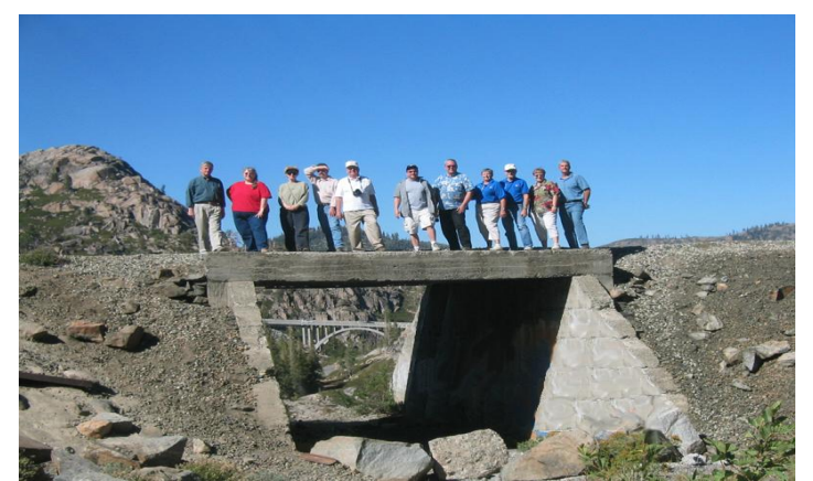
Participants of Tour #3, 2006 posing at Donner Summit

NOTE: All tours depart the Holiday Inn Sacramento Northeast, Madison @ I 80 at 9:00 am. Boarding begins at 8:45 am.