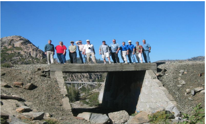
Participants of Tour #3, 2006 posing at Donner Summit

NOTE: All tours depart the Holiday Inn Sacramento Northeast, Madison @ I 80 at 9:00 am. Boarding begins at 8:45 am.