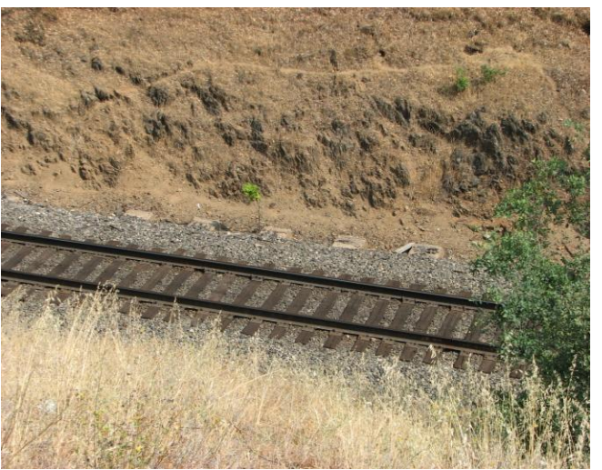
Location of highway bridge at end of Apple lane off Bowman Road