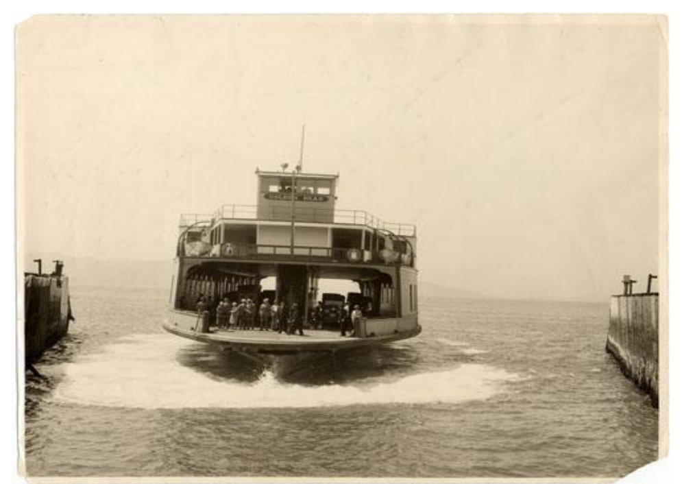
Ferry Boat Golden Bear entering slip at Berkeley Pier 1927