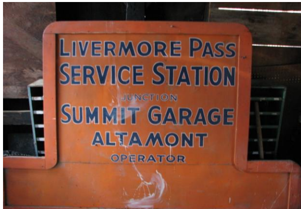
Sign located on 1938 Livermore Pass