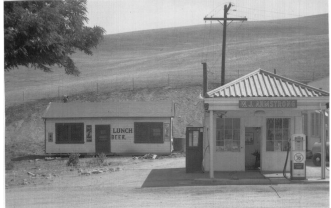
Armstrong Station and Cafe at Carroll Rd.