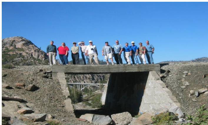
Participants of Tour #3, 2006 at Donner Summit

Tour # 4 Central Valley Route Sacramento to San Francisco Via Carquinez Strait