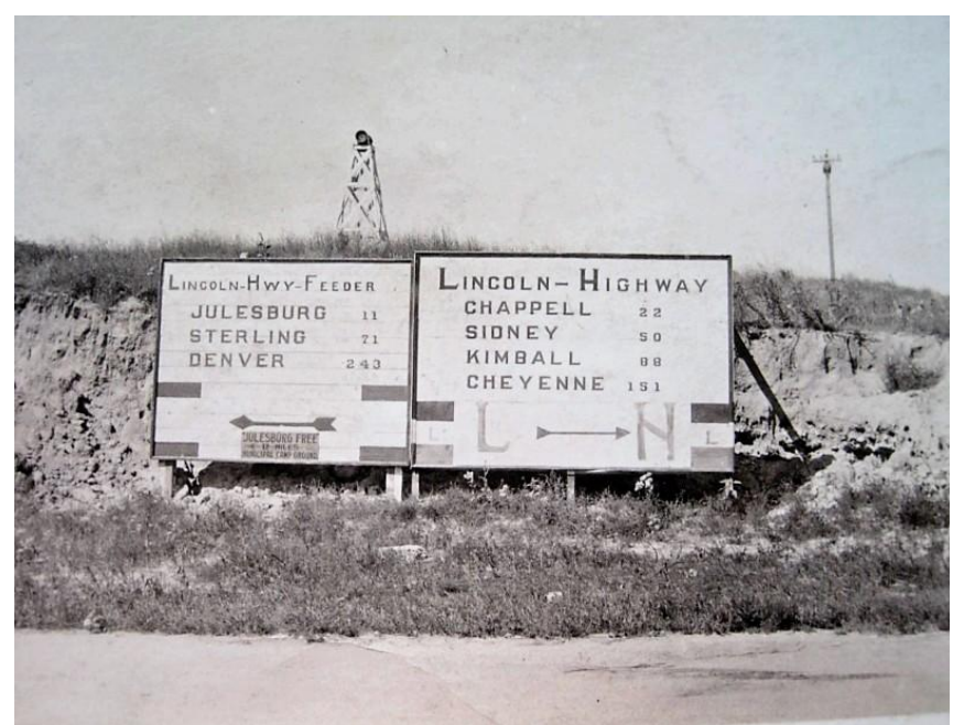
The back of this photo states that "we went right"

Crossing an unknown river on a combo highway / railroad bridge. The cars name "Genieve" is painted on the radiator and the inscription "Chicage to Texas" is painted under the windshield. Note the three license plates above the running board and what appears to be the inner tube protruding from the right front tire.