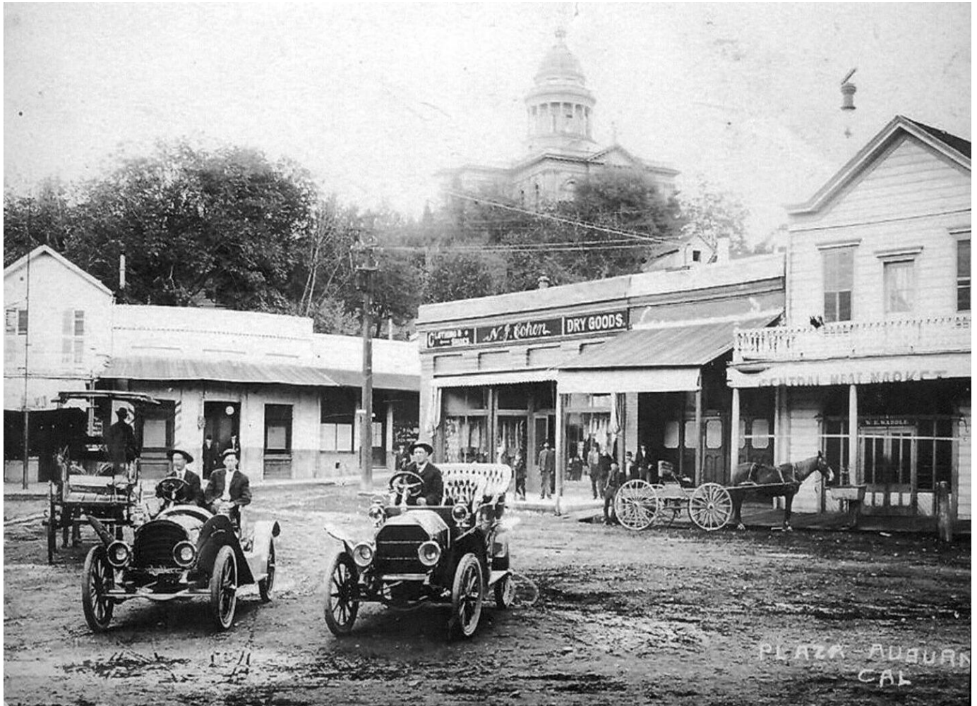
“ The Plaza ” Auburn, Ca.