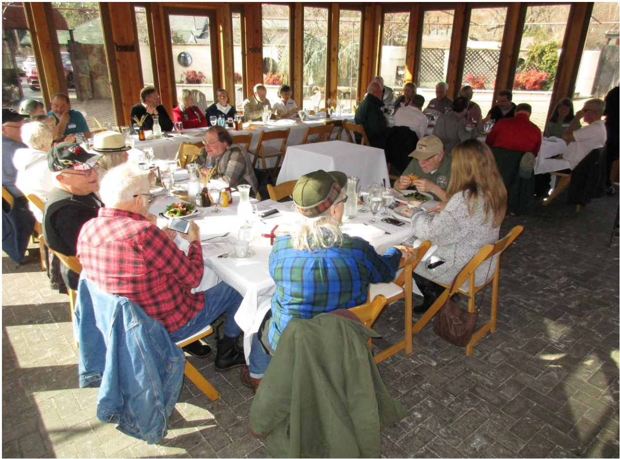
Members and guests enjoying the pre-meeting lunch on the outside patio.