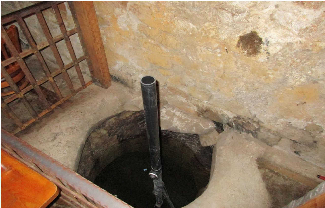
Entrance to the Blue Lead Mine located in basement dinning area of house.