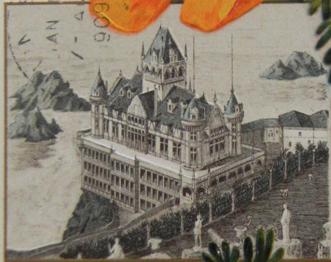
SAN FRANCISCO CAL.