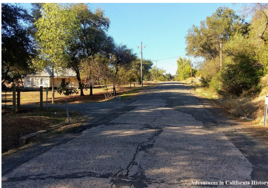
Sisley Road, the longest section of original LH concrete in Placer County